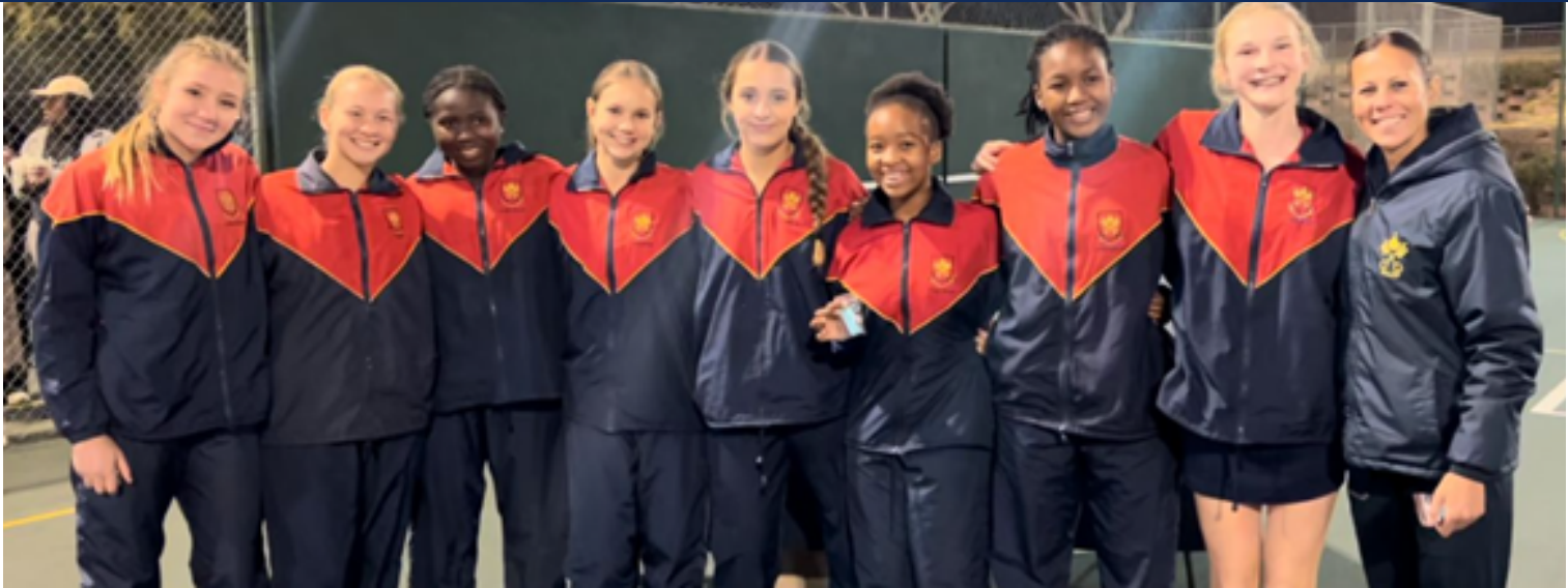
U14 A – Bronze

The success of our U15 A team, who emerged as champions, is a particularly proud moment for our school. Their hard work, dedication and teamwork have truly paid off; they have set a high standard for future teams to aspire to. The U15 A team completed the entire season without a single defeat.